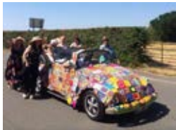
Grant to Croston Knit Wits

Croston Together is all about making the most of the wonderful village we live in, by bringing people together and supporting the local community.