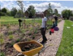
Support in developing our village park